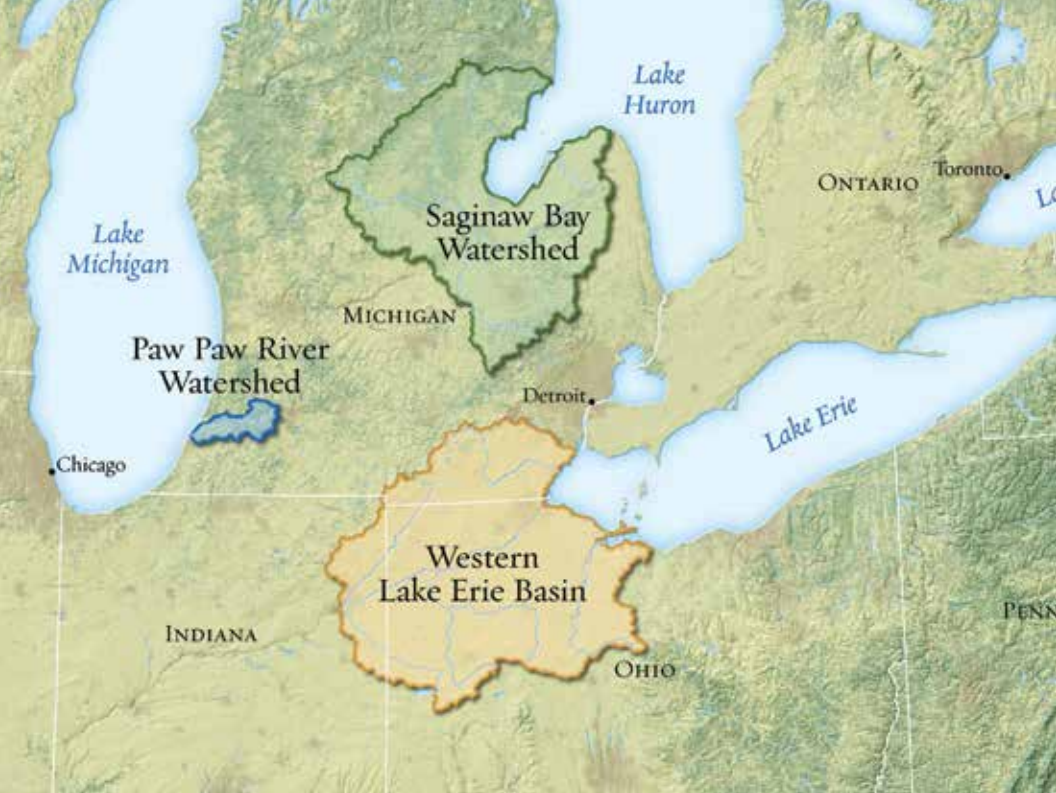
In each of the three watersheds shown above, the team is testing and developing key conservation strategies that can be implemented across the Great Lakes.