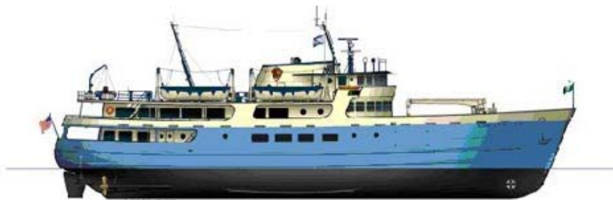
Motor Vessel Ranger III

From our point of view at the Fund, 2014 will be a big year for the ABTV project and team. It will see the team begin to install a prototype system on two different working vessels. One, the Ranger III , is a vessel operated by the U.S. National Park Service and equipped with two ballast treatment systems. Once aboard this ship, the team will learn a great deal about their system's ability to verify treatment and perform in real-world operating conditions.